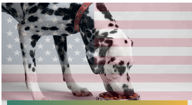
FeedNavigator - AAFCO authorization

Dive into the latest updates and highlights of our partners' successes, as well as new opportunities for advancements in the Farmyng project.