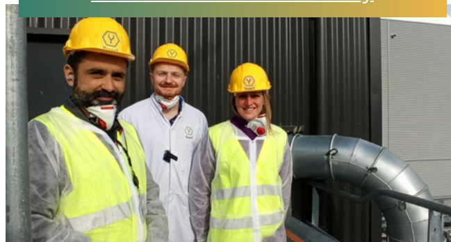
France Bleu - Frass Delivery