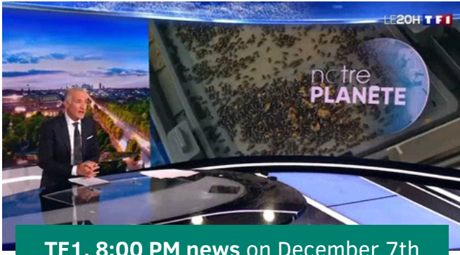
TF1, 8:00 PM news on December 7th

Ÿnfarm has been featured in reports broadcasted on two major French television channels : TF1 and M6.