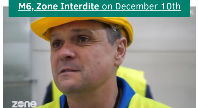
M6, Zone Interdite on December 10th